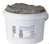
PM588 Air Drying Clay