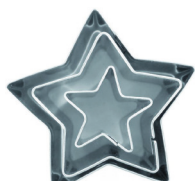
PM621 Shape Cutters