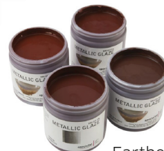
PM382A Earthenware Glazes